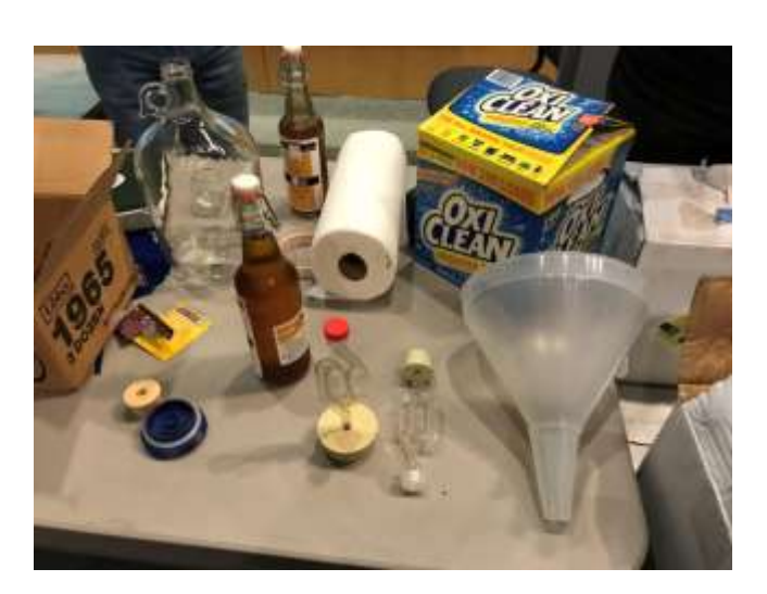
Above, some tools of the trade

Necessary Equipment: Antony noted that a mead-maker needs not just equipment, but also sanitation to clean that equipment, ingredients, including the yeast, and then, finally, a procedure to follow to make a batch. For equipment, many start with the one gallon carboy: glass is easy to sanitize. A professional mead-maker will need plenty of these gallon jugs for making experimental batches, and even a hobbyist will want more than one for racking – taking the first fermentation out of one and into the next one. They are not that expensive, Antony says, and good to have around. Antony noted that some use five-gallon food grade buckets as fermentation pails: it's important, if you use any plastic, that it be food grade to prevent contamination and odors. Honey is often delivered in five gallon buckets like that. You can put a suitably-sized cork into the carboy with an airlock through the cork's centre: with water inside, pressure builds