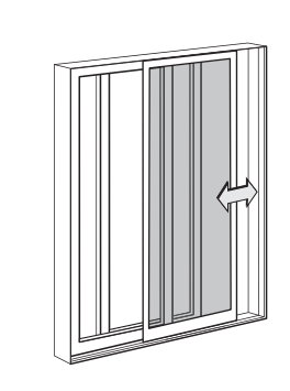
Gliding insect screens are available for two-panel doors.