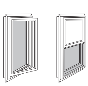
Insect screens are available for all venting windows.

Insect screens for windows and patio doors have a fiberglass screen mesh. Optional TruScene® insect screens for windows are made with a micro-fine stainless steel mesh, providing 50% more clarity than our conventional insect screens.