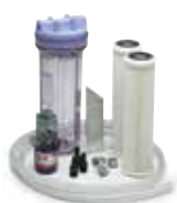
Silt Reduction Kit

For waters with high levels of suspended matter, e.g. in shallow anchorage, we would recommend you use an additional prefilter. This additional filter is finer (5 microns - 1 micron = 0.001 mm) than the standard filter (30 microns) and is placed after it. A booster water pump (12V/0.8 A/h) is also provided. This pump compensates for the loss through the second filter and increases water production. We would also recommend the prefilter kit when the PowerSurvivor is not installed under the water line and when it is in constant use to increase the intervals between servicing.