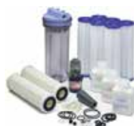
Preventative Maintenance Kit