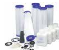
Extended Cruise Kit

Katadyn reserves the right to modify products