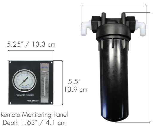
Pre-Filter Depth 6" / 15.2 cm