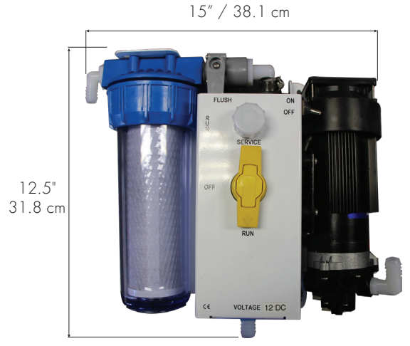
Feed Pump Module Depth 4.5'' / 11.4 cm