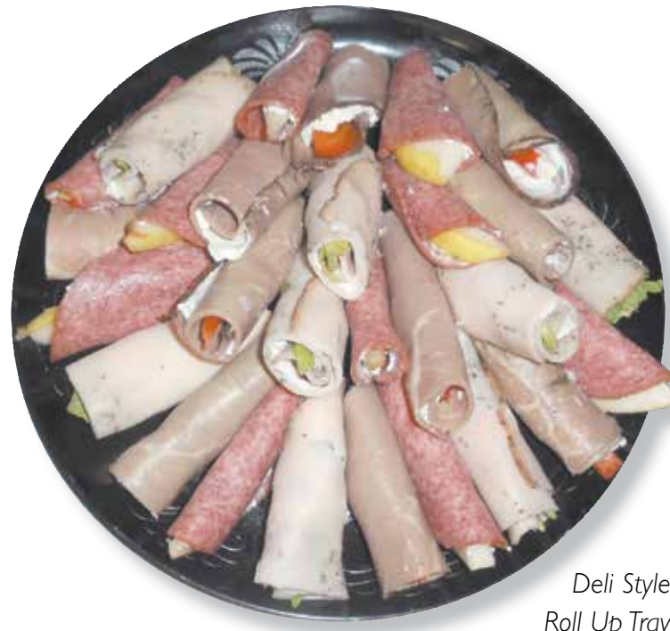
Deli Style Roll Up Tray

A variety of your favorite cheeses arranged for easy serving for sandwiches or crackers.