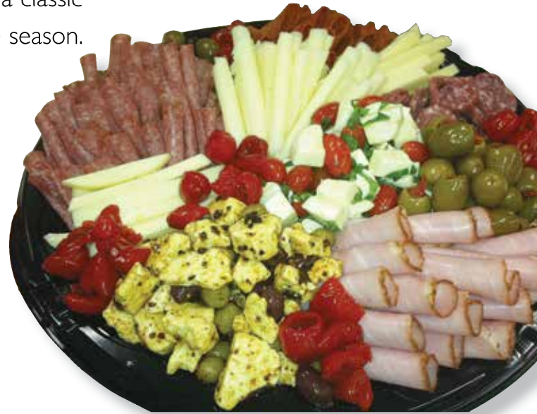
Italian Antipasto Platter