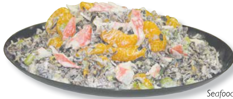
Seafood Wild Rice Salad