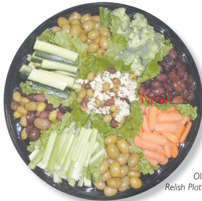
Olive Relish Platter