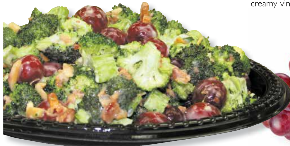
Broccoli Grape Salad

Our popular salad is made up of broccoli and grapes, accompanied by bacon, toasted almonds, celery and onion in a creamy dressing.