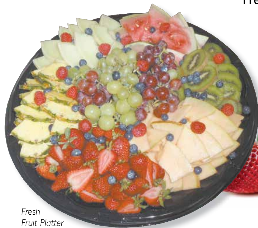
Fresh Fruit Platter