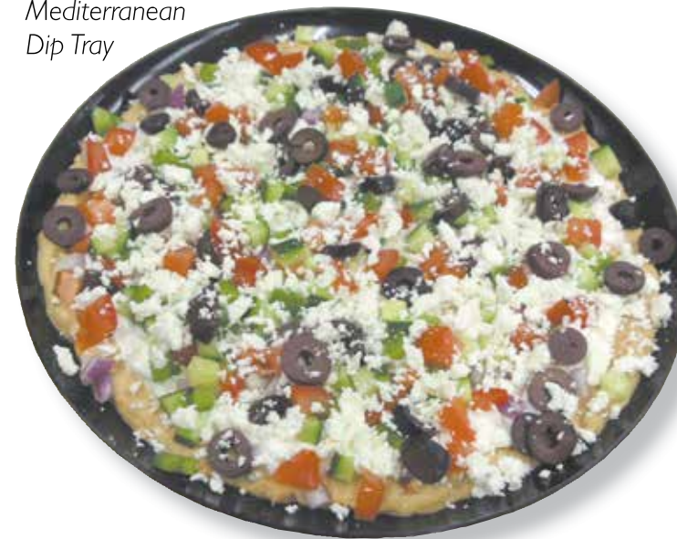
Mediterranean Dip Tray