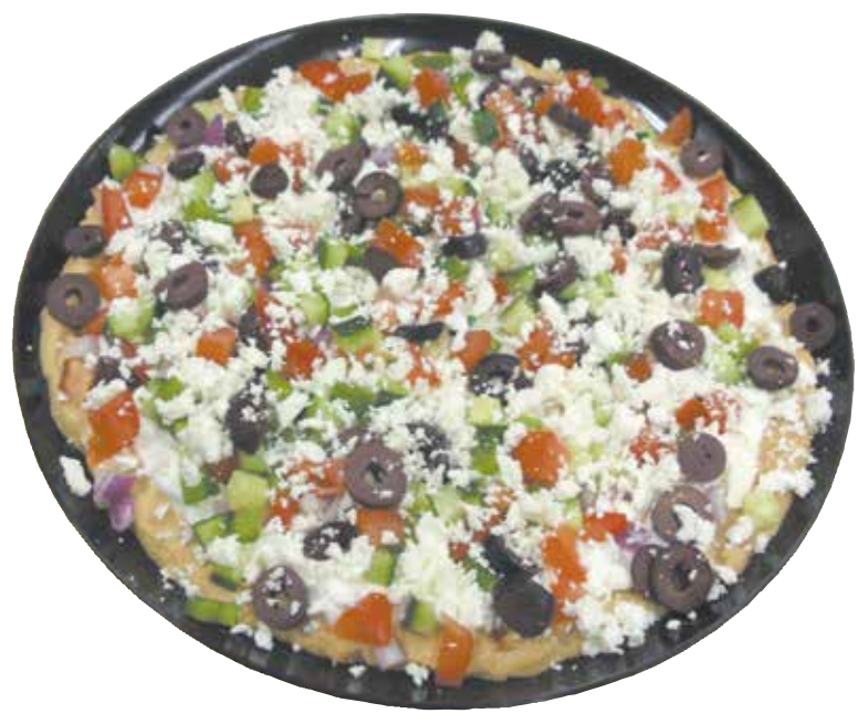
Mediterranean Dip Tray