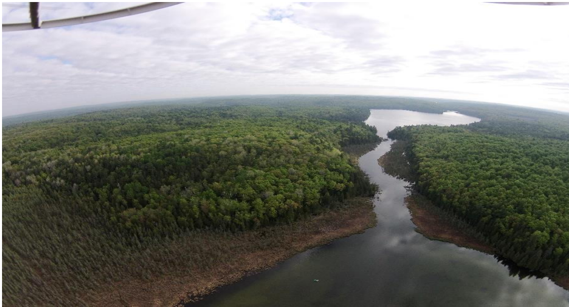
Drone flight between Malcolm and Ardoch

Another year with caution and monitoring for everyone's health to avoid Covid-19. Health Guidelines and Restrictions are the main topic on the radio and newspapers daily. Yes, we all feel like grumbling about the "new normal" but at least our lakes are not among the high-risk zones. For those coming from urban sites, we offer our thanks for following the rules to avoid the spread. When lockdown is over, those of us who live permanently on the lake look forward to visiting an urban site, while the seasonal cottage owners I am sure would like to have a long peaceful time at the cottage.