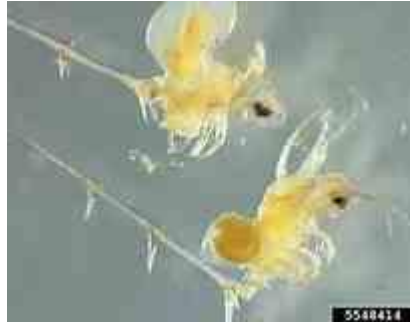
Spiny water fleas