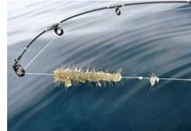
Spiny water fleas

Since the development of The Lake Plan in 2015, the Stewardship Committee has worked consistently to implement and monitor strategies to protect the two lakes. We have appreciated the membership's co-operation and support whenever we have reached out for volunteers, funding or to be stewards for your own lakeshore. Many property owners have participated in education sessions, prevention strategies, Weed Watchers, Loon Watchers, Walleye bed rehabilitation and shoreline rehabilitation programs. When we offered the Love-Your-Lake Program, not just MALLA members, but almost 100% of property owners participated. This is a testament to the owners who value their lake property and a desire to keep it protected for future generations.