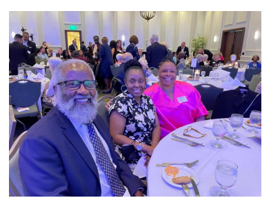
A sellout - 320 people attended the Gala at GROVE.