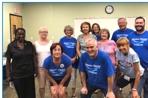
Area 1 Team