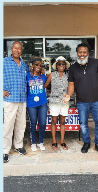
The MCDBC is having great success with voter registration.