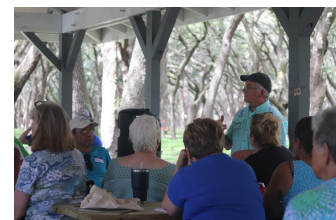
Nearly 50 people attended the picnic and informative talk.