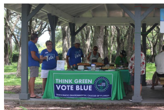
Food and beverages were provided and Environmental Caucus T-shirts were available