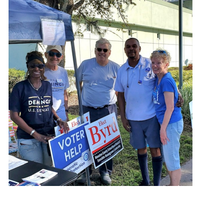
Helpful information is available from Poll Greeters. You can vote at ANY of the five Early Voting locations, now through Nov. 6 from 8:30 a.m. to 6 p.m.