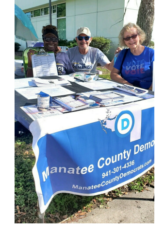
Poll Greeters at the Palmetto Library Early Voting site.