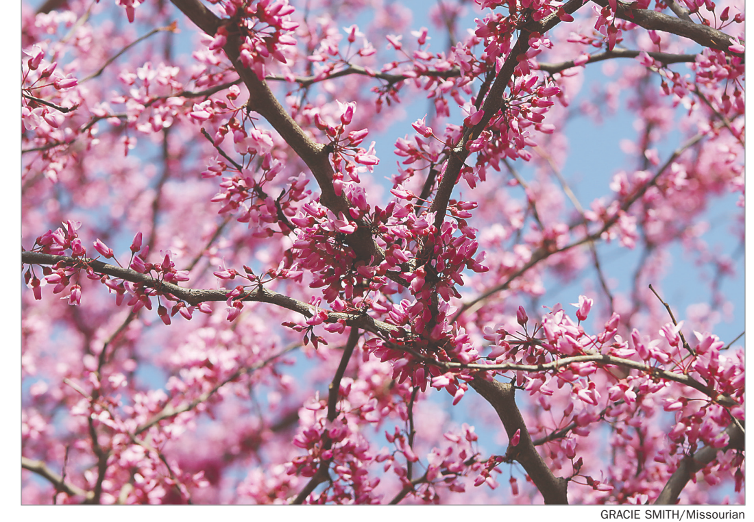
Eastern redbuds bloom at Shelter Gardens in Columbia. Shelter Gardens has 300 varieties of shrubs and trees in its five-acre botanical garden, as well as a memorial to veterans lost in the Vietnam War.

Helmi Sheely, owner of Helmi's Gardens, waters growing plants Wednesday at Helmi's Garden in Columbia. Sheely opened the garden in 2012 to pursue her gardening passion and guide others toward their dreams.