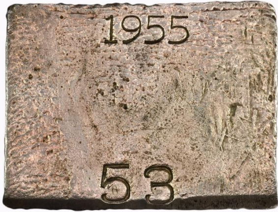
ORIGINAL OBVERSE / SHEARED REVERSE