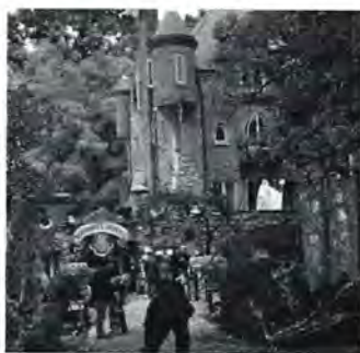
Halloween Festival at the Castle