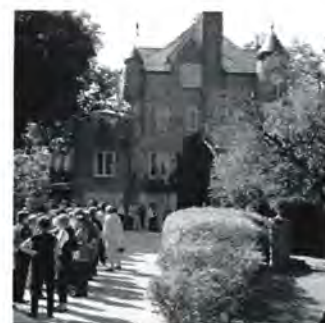
Cooks Tour September 2014

We plan to put together a Castle Facebook page, which will encourage anyone who has ever had their family photographs, weddings, anniversary, or other, done at the Castle, to put them on the Friends of the Castle Facebook page.