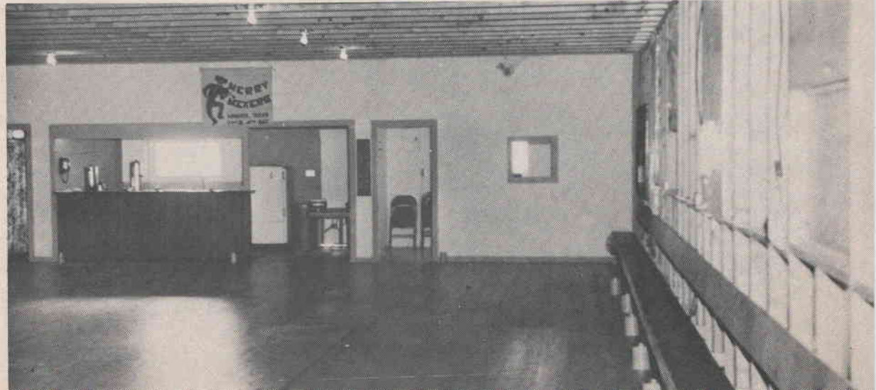
Interior of the Merry Mixers hall before the walls were paneled. Coffee bar, kitchen and storage is at the rear.

Club Presidents Harmon and Joy Wilson believe that the key to this type of plan is that the members must be inspired, educated and motivated. They feel that the type of construction, the floor plans and even the financing are secondary.