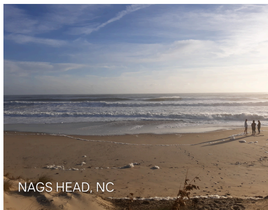
NAGS HEAD, NC