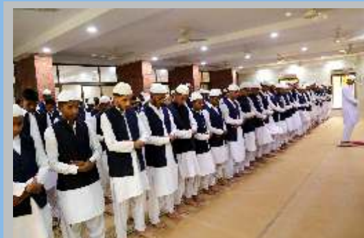
AIR CONDITIONED MOSQUE