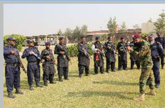
ROUND THE CLOCK ALERT SECURITY STAFF