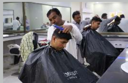
NEAT AND HYGIENIC BARBER SHOP