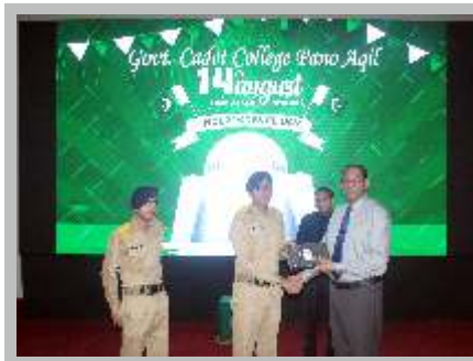
PRINCIPAL CCPA, COL SAADATULLAH (R) DISTRIBUTING AWARDS DURING INDEPENDENCE DAY