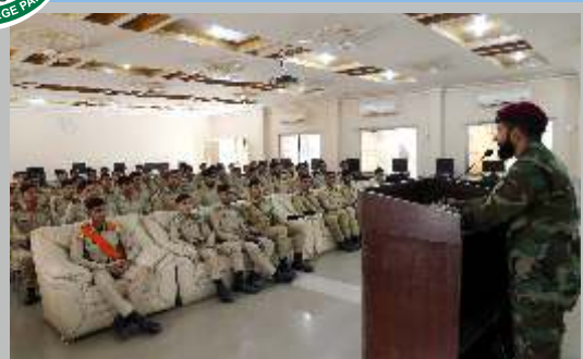
WEEKLY GROOMING SESSIONS BY COLLEGE ADJUTANT