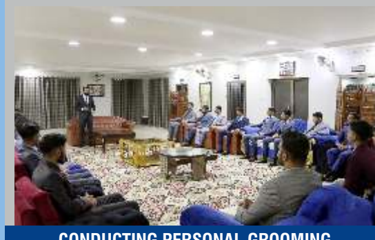
CONDUCTING PERSONAL GROOMING PROGRAMME OF CLASS XII