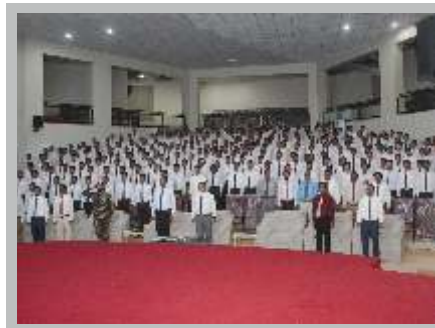
FACULTY AND CADETS OBSERVING INDEPENDENCE DAY IN RECENTLY ESTABLISHED COLLEGE AUDITORIUM