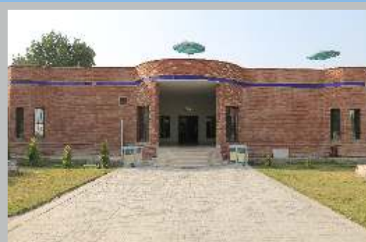
EXTERNAL VIEW OF COLLEGE CAFÉ