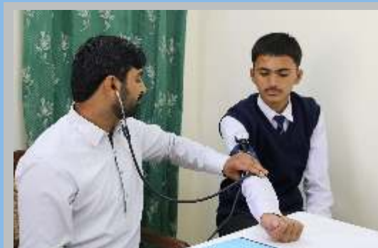
FULLY EQUIPPED COLLEGE DISPENSARY