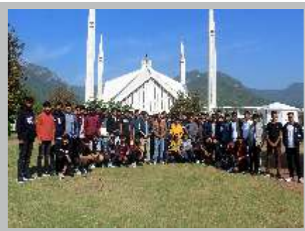
CADETS AT SHAH FAISAL MOSQUE (Islamabad)