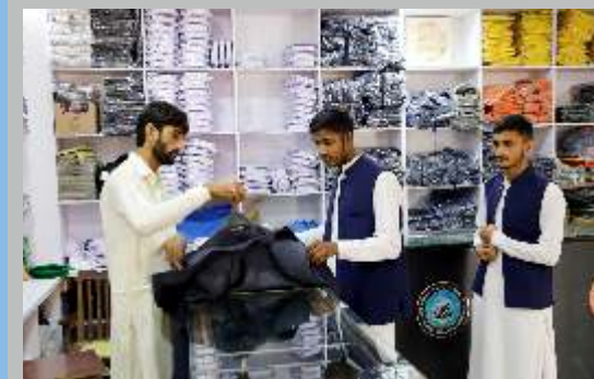
UNIFORM AND KIT ITEMS SHOP