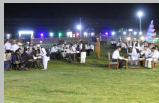
CADETS ENJOYING BAR B Q NIGHT AT QASIM PARK