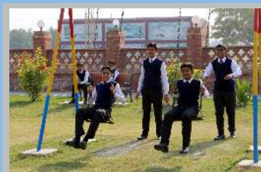
CADETS ENJOYING THEIR BREAK TIME