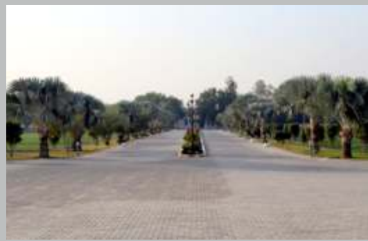
THE COLLEGE ENTRANCE