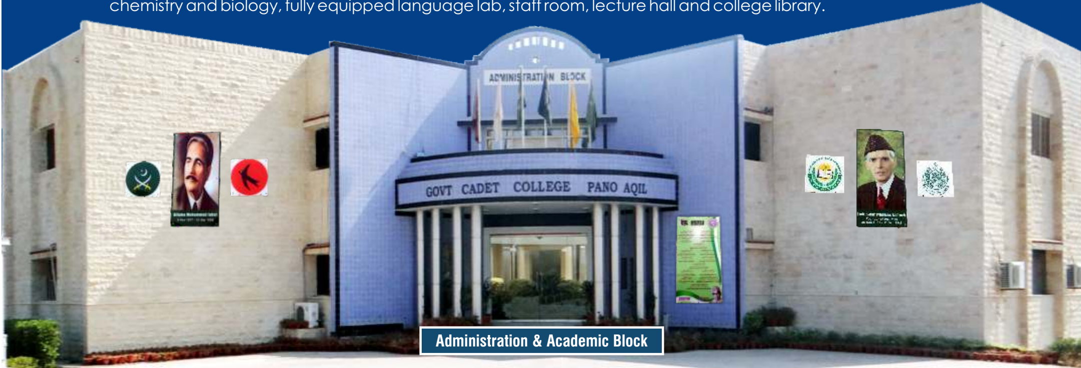
Administration & Academic Block

The main building consists of two blocks, viz academic block and admin block. The spacious diamond shaped double storey building houses all the administrative offices in addition to classrooms, laboratories of physics, chemistry and biology, fully equipped language lab, staff room, lecture hall and college library.