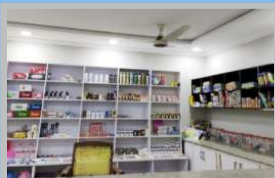
STATIONERY AND GENERAL STORE