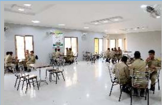
COLLEGE CAFÉ FROM INSIDE