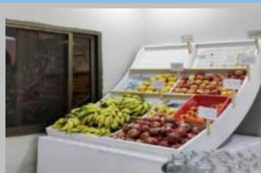
FRUIT AND JUICE SHOP IN AQIL'S ARCADE