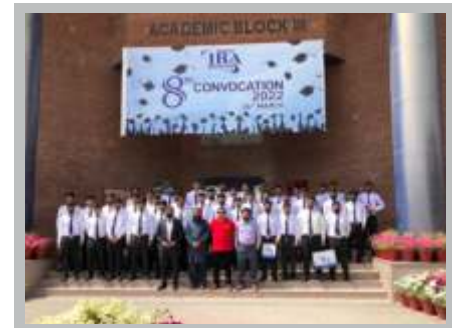
CADETS OF CLASS XII DURING VISIT OF IBA UNIVERSITY SUKKUR