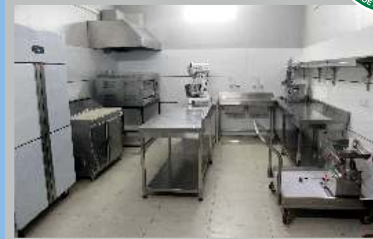
HYGIENIC AND STANDARD MESS KITCHEN