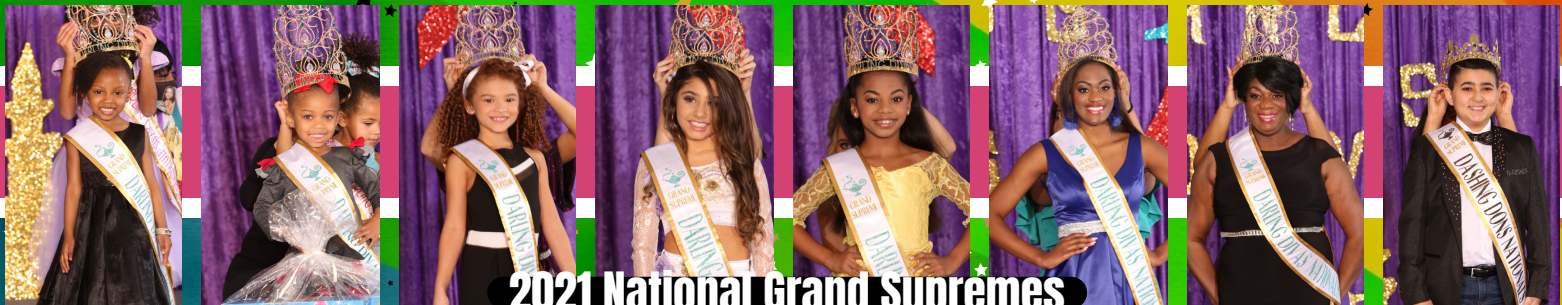
2021 National Grand Supremes

At DDP, we strive to be a pageant that is fair & fun. We hope that you will also strive for both. We hope that the families who participate in our pageant treat each other with respect. We want to make our event as fun-filled and stress free as possible. Inappropriate behavior will not be tolerated and can result with the responsible family being asked to leave without any refund.