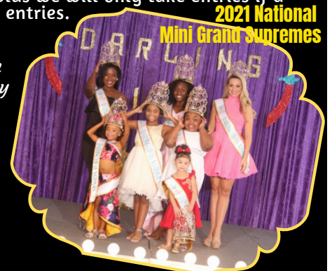
2021 National Mini Grand Supremes