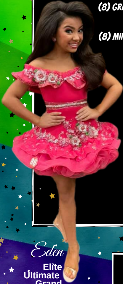
Eden Elite Ultimate Grand Supreme

BOYS WILL RECEIVE MEN CROWNS FOR THEIR TITLES