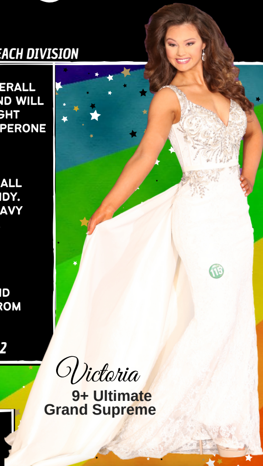
Victoria 9+ Ultimate Grand Supreme