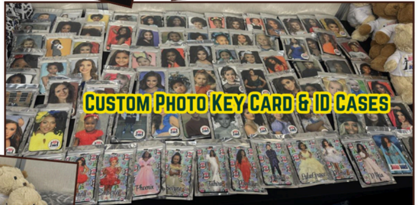
CUSTOM PHOTO KEY CARD & ID CASES