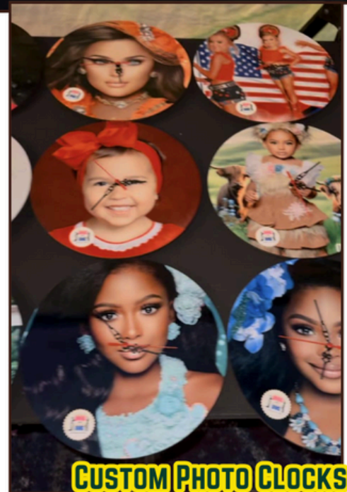
CUSTOM PHOTO CLOCKS