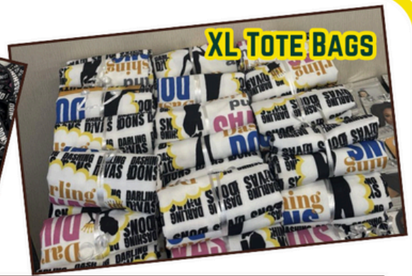
XL TOTE BAGS