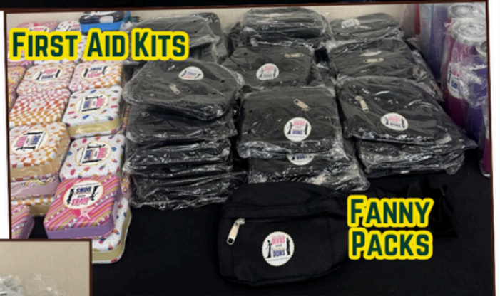
FIRST AID KITS