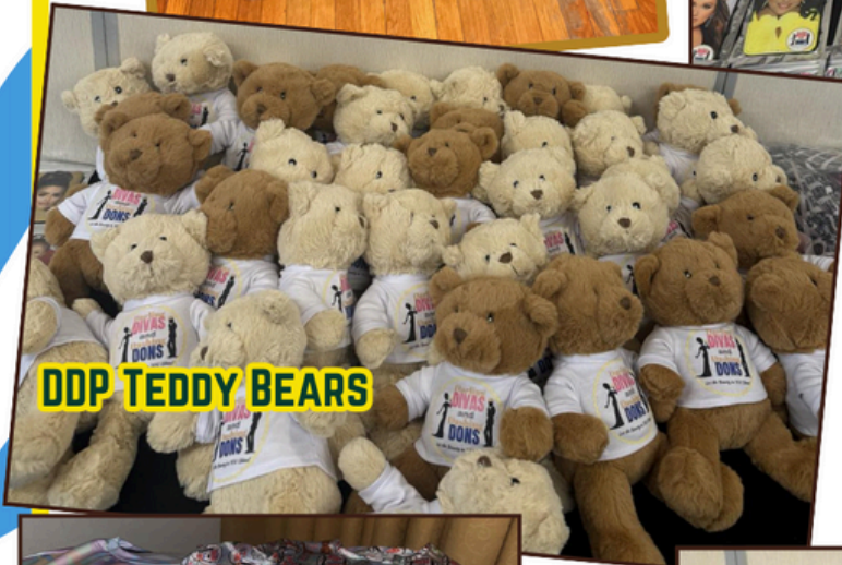
DDP TEDDY BEARS