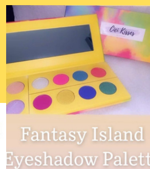
Fantasy Island Eyeshadow Palett