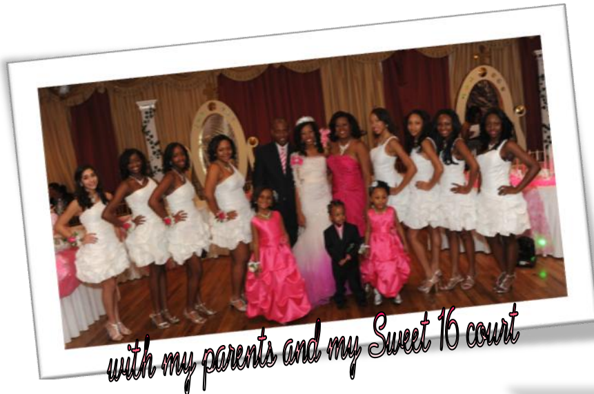
with my parents and my Sweet 16 court

Let me know of YOUR special birthday celebration and it could be pictured on an upcoming page.