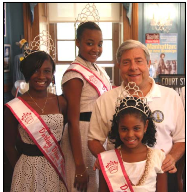
A visit with Brooklyn Borough President Marty Markowitz