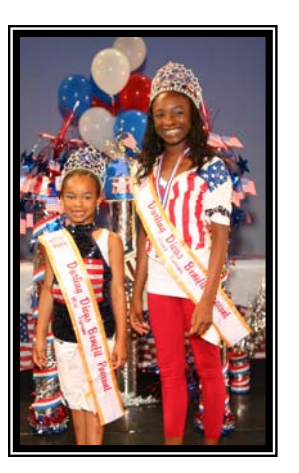
Our Toy Ambassador with special guest