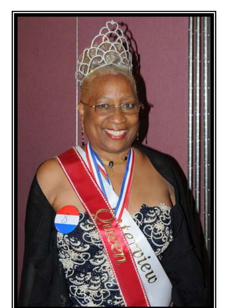
Congratulations – you are truly a "Gorgeous Diva"