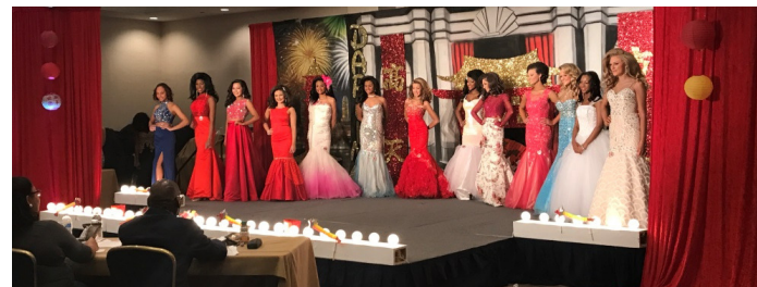
Diva Beauties In A Row