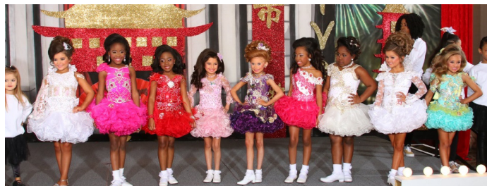
Beauties In Line