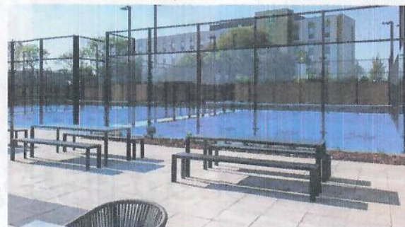
Padel courts at a different David Lloyd Club

Councillors have delayed a decision on whether to let a David Lloyd gym in Bristol keep two new floodlit padel courts built without planning permission amid fears for wildlife in nearby woods. The city council's development control committee voted by 7-2 to defer an application by the private premium fitness club in Westbury-on-Trym because of conflicting evidence about the presence of and potential harm to protected species including bats, owls and badgers at Badock's Wood , a site of nature conservation interest (SNCI).