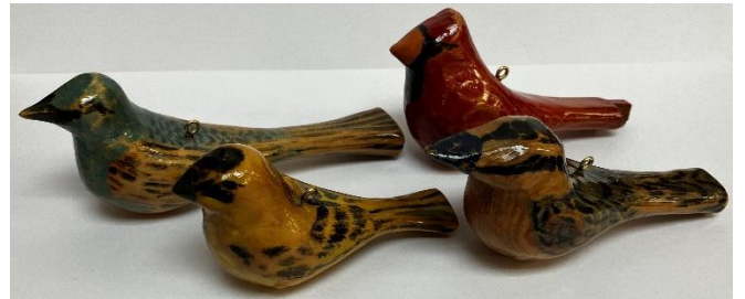
Fred Wuthrich's Comfort Birds