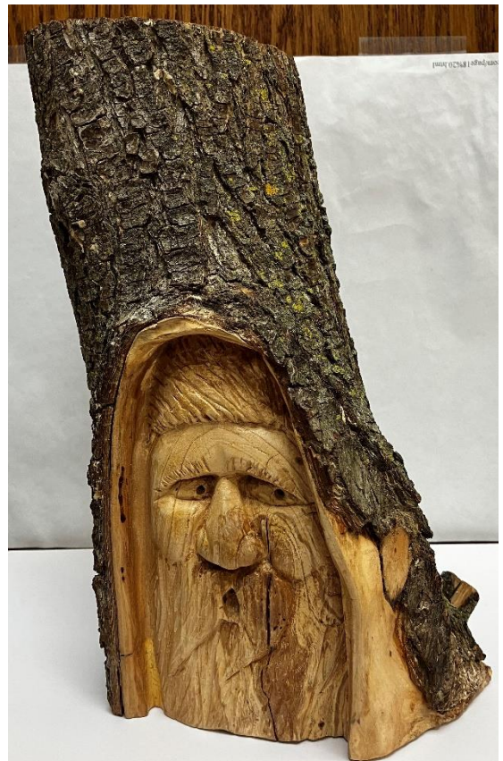
Noel Zimmers' Spirit Log