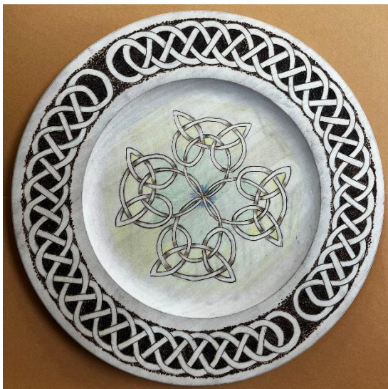
Bud Cunninghams' Wood Burned Plate