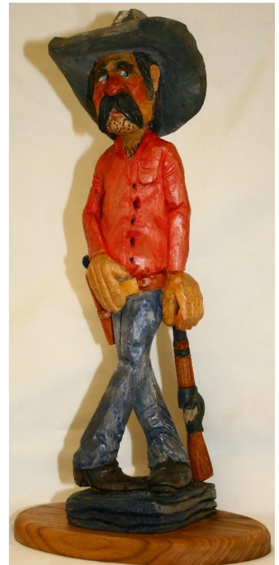
Brad Crandalls' Cowboy Caricatures