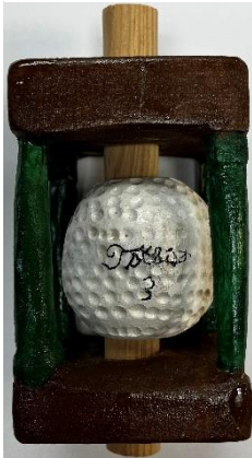
Randy Callisons' Golf Ball Cane Segment Complete with 37 or 39? Divots