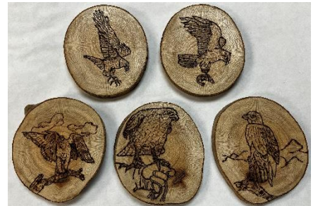
Denny Pryces' Wood Burned Butterfly, Flower, and Bird Discs