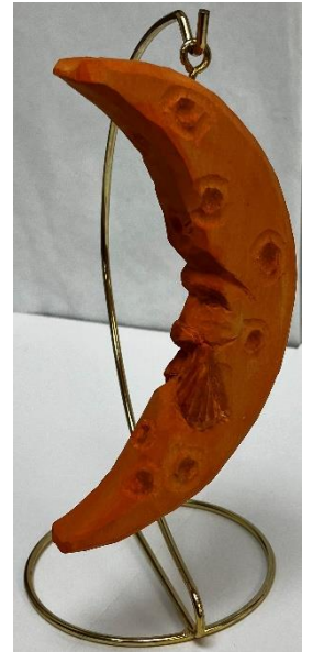
Ernie Tuckers' Moon Man with Craters