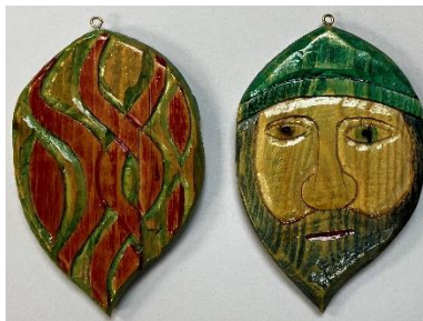
Fred Wuthrichs' Face Ornaments