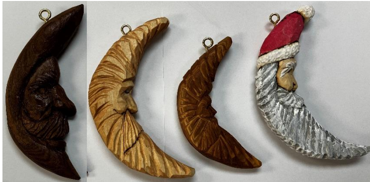
Ernie Tuckers' Moon Men