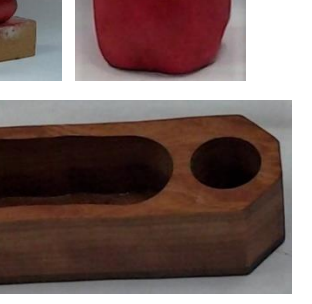
Ernie Tucker's Olive Server