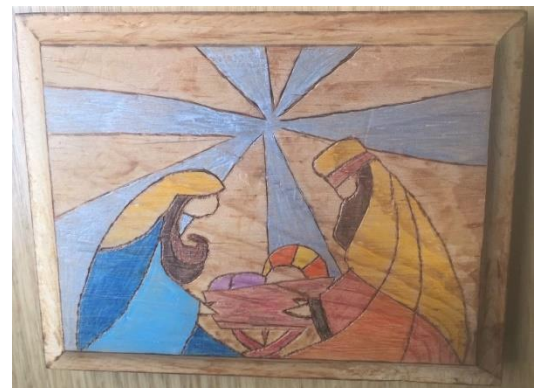
Robin Rios Woodburned Plaque