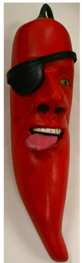
Fred Stenmans' Pirate Pepper