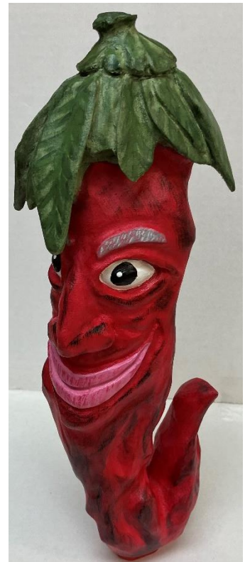
Tom Kautz' Smiling Pepper