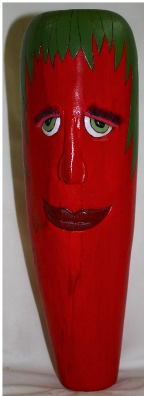
Rosie Kautz' Long-Haired Pepper