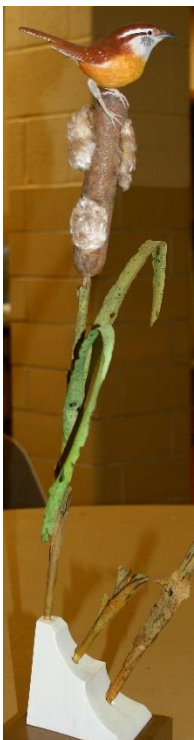
Cattail and leaves were all created by Jim Trumpy using brown paper bags.