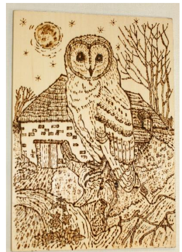
Denny Pryces' Owl Pyrography