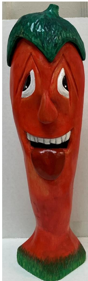
Dale Ehles' Pepper