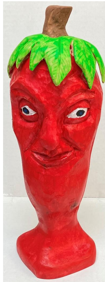
Ed Hogues' Pepper