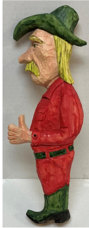
Jim Trumpys' Cowboy Pepper