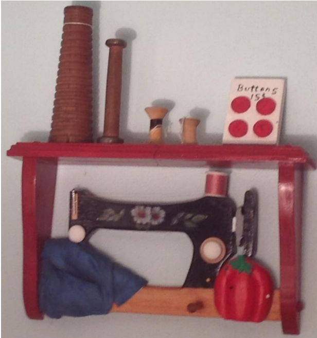
Ed Hogue's Sewing Display with carved buttons, pin cushion, and part of the sewing machine