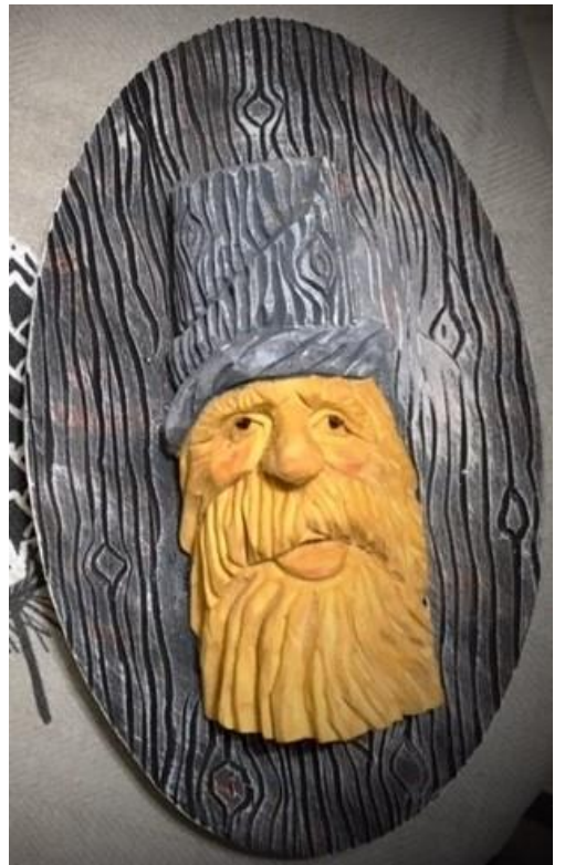
Ernie Tuckers' Wood Spirit