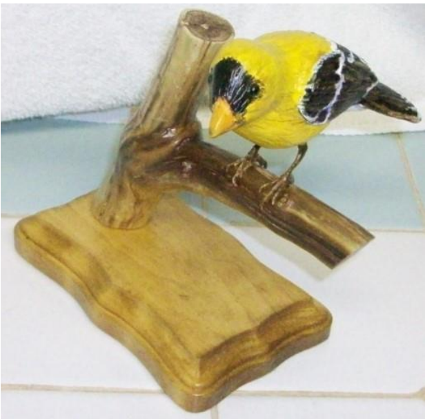
Bud Hilgendorf's Goldfinch