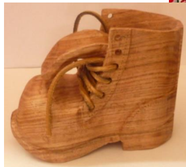
Gus Helling's Carved Boot