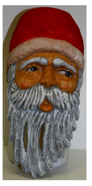
Ernie Tuckers Shelf Sitter