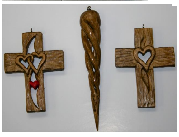
Dale Ehles' Carvings