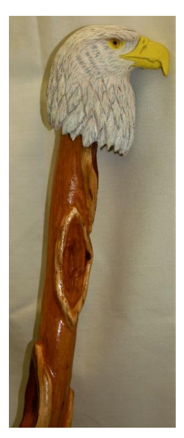
Jim Trumpys Eagle Cane