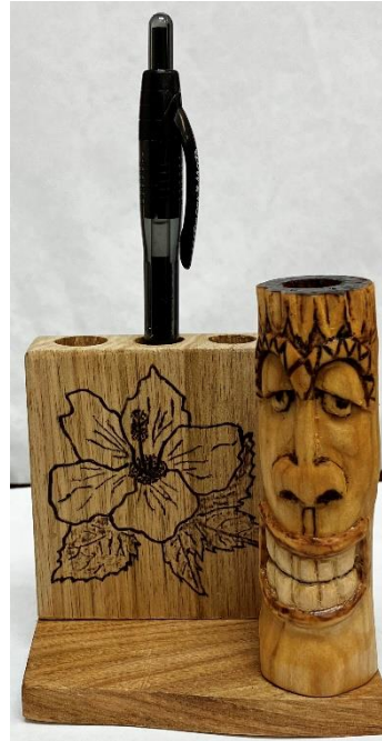
Denny Pryces' Pen Holder