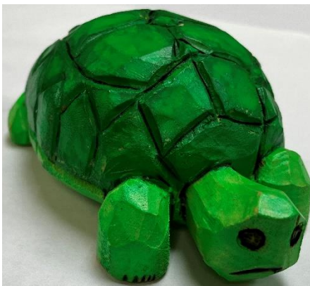
Ernie Tuckers' Turtle