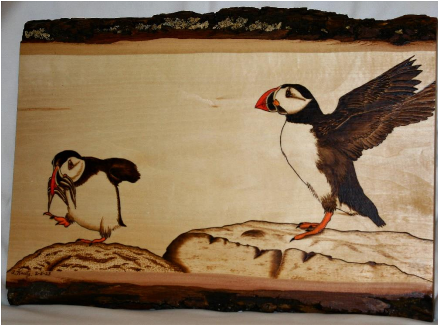
Rosie Kautz' Puffin Pyrography