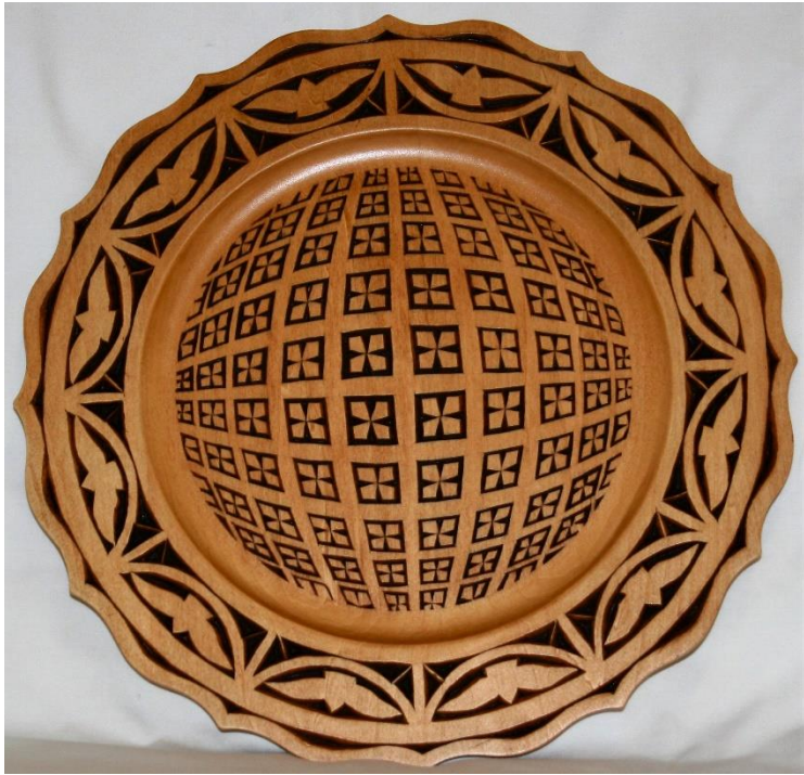
Ray Douglas' Chip Carved & Stained Plate – Notice that the expert pattern layout makes the center look domed on the flat plate!