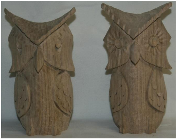
2 out of 6 carved Owls by Tom Kautz and a few of the Comfort Crosses he's done.