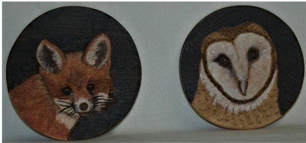
Wood burned Owl and Fox Magnets by Rosie Kautz