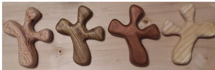
Denny Pryce has been busy carving the Comfort Crosses (above finished ones and those in progress on the left) and is also working on the "Knothead."