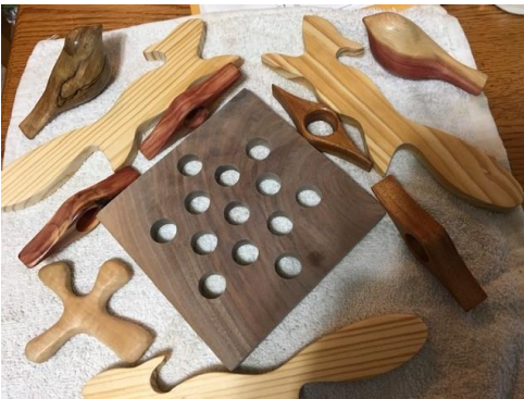
Ernie Tucker has been carving Comfort Birds, Crosses, a Trivet, and many other items.