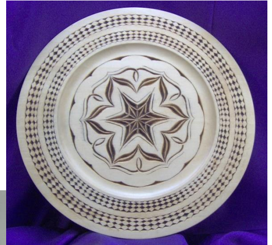
Ray Doulas' Chip Carved Plate