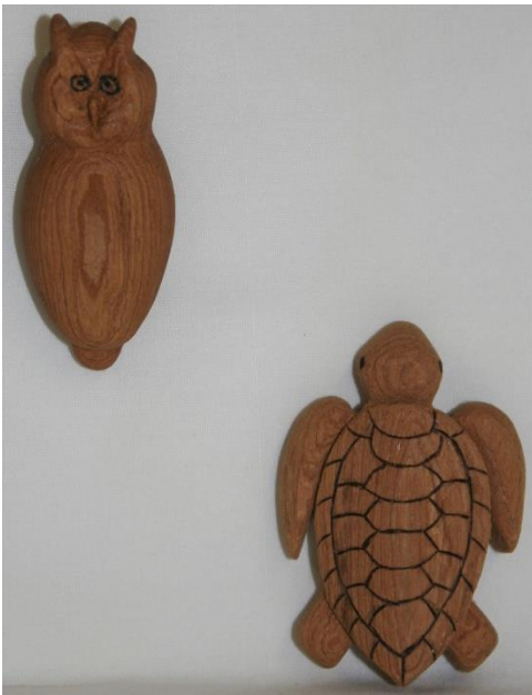
Rosie Kautz' Cottonwood Bark Owl Pin and Turtle