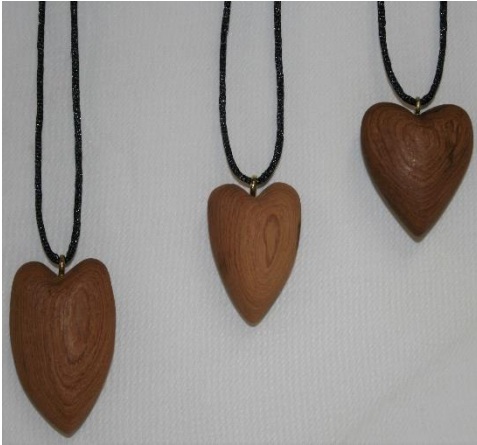
Rosie Kautz' Cottonwood Bark Necklaces