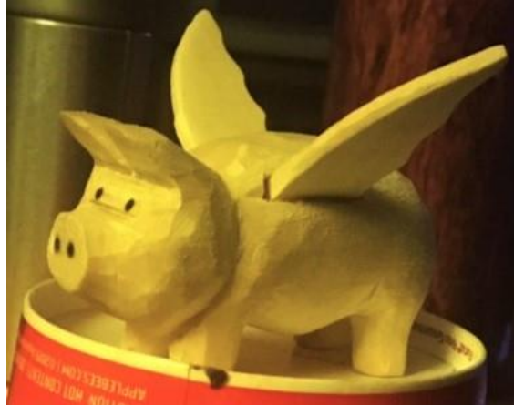
Ernie Tucker's Flying Pig