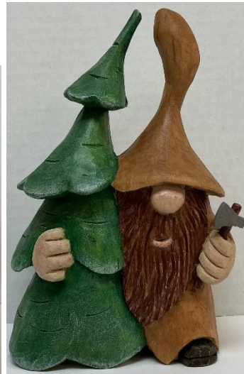
John Raisbecks Knome