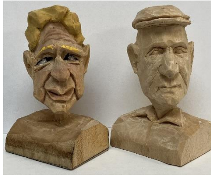
The 2 Faces below were also done by Jim Trumpy