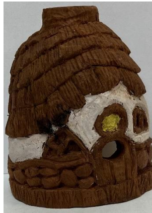
Ernie Tuckers Bee-Hive Bark House