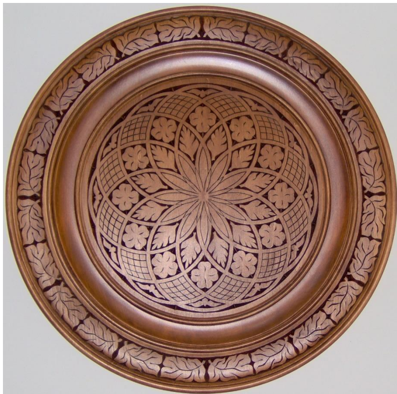
Ray Douglas' 30-inch Round Chip Carved Basswood Plate