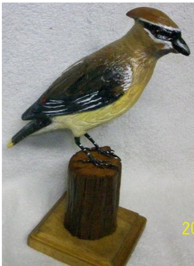
Bud Hilgendorf's Cedar Waxwing