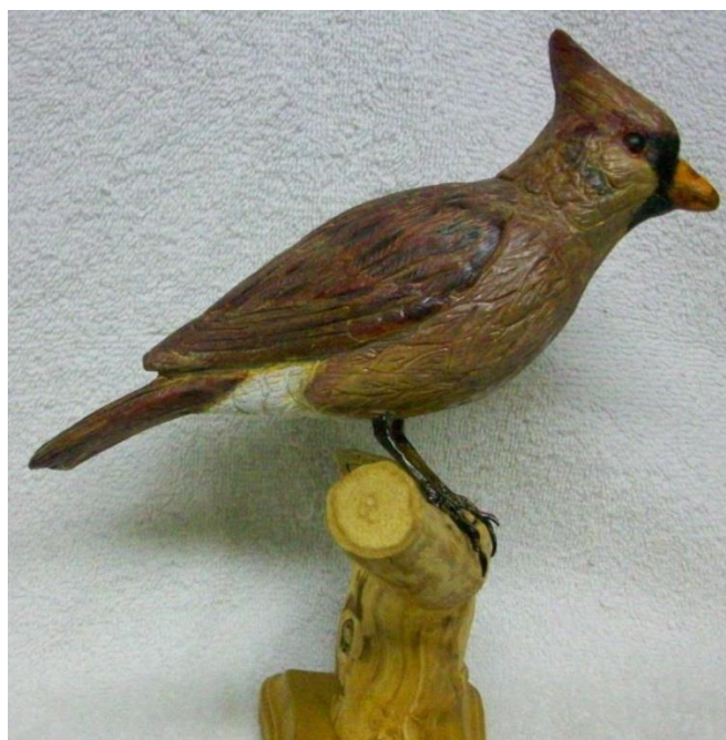
Bud Hilgendorf's Female Cardinal