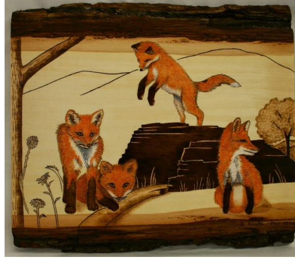
Fox Kits at Play won in Pyrography for Rosemary Kautz