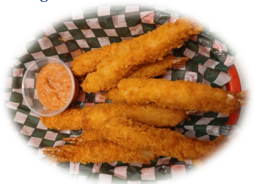
Deep Fried Coconut Shrimp

Sweet potatoes are the #1 most nutritional vegetable