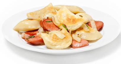
Perogies & Sausage