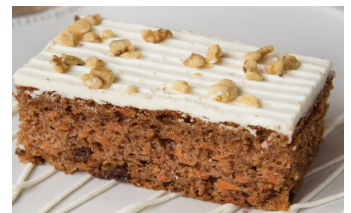
Country Style Carrot Cake