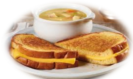
Soup & Sandwich Salad