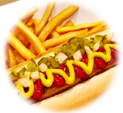
Grilled Hot Dog

poutine or caesar salad add - $4.50, sweet potato fries (8 oz) or onions rings (8 oz) add - $3.50