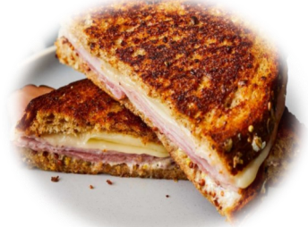
Grilled Ham & Cheese

donair meat, mozzarella cheese, onions, tomato, sweet sauce