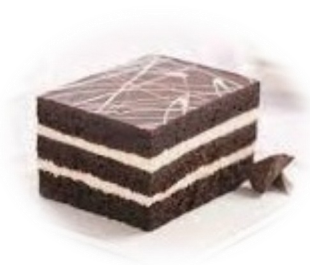
Gluten Free Chocolate Cake

creamy vanilla cheesecake on a graham cracker crust topped with strawberries in syrup or choose our chocolate or caramel sauce instead. Your Choice