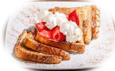
French Toast w/ Strawberries & Cream

Eating one egg a day can reduce the risk of having a stroke by 12 %