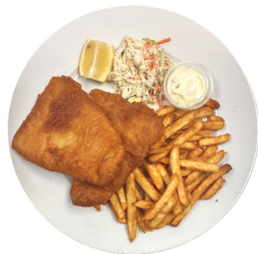
2 Piece Fish & Chips