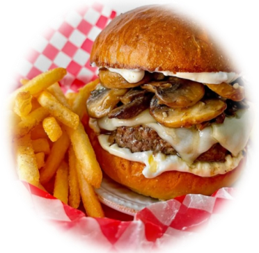
Mushroom Mozzarella Burger