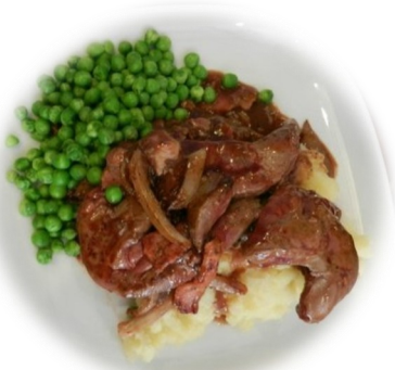
Liver & Onions