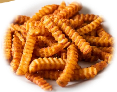
Sweet Potato Fries