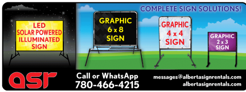
Alberta Sign Rentals