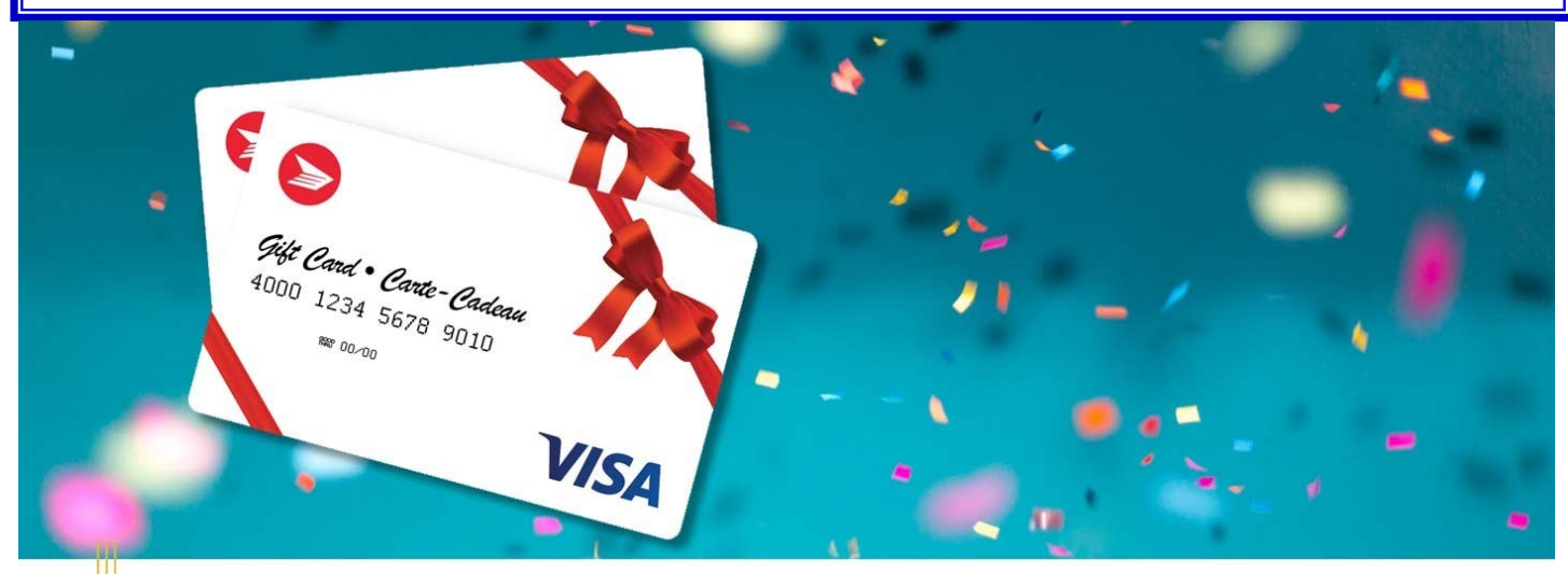
Refer a friend to the Legion for a chance to win

The bigger our membership, the bigger the impact the Legion can make in the lives of Canada's Veterans. Encourage your members to invite an eligible friend or family member to join online here before March 30 using promo code REFER. Both current and new member will be entered for a chance to win a $500 Canada Post Visa gift card.