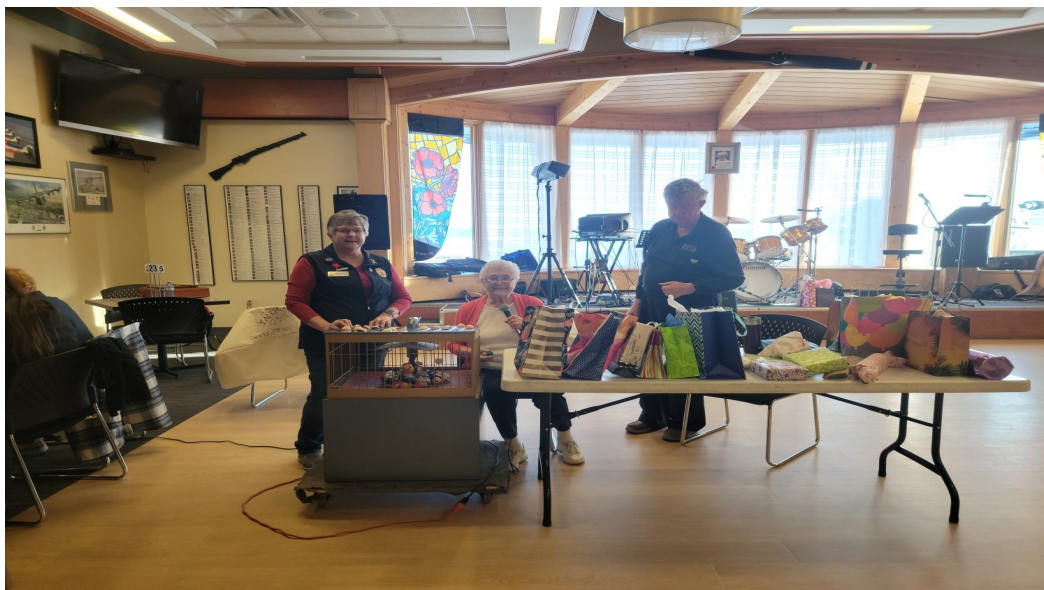
Button bingo Saturday, January 14th , 2023