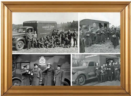
Canadian Legion War Services vehicle overseas during WWII