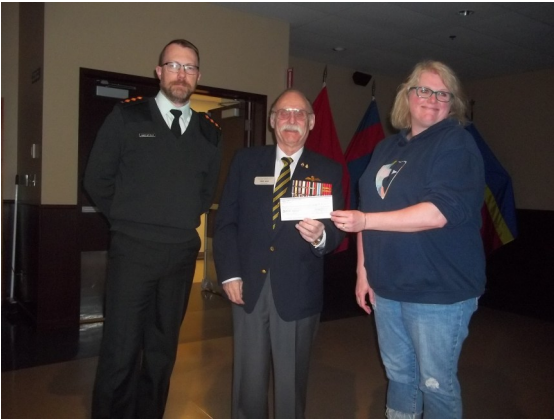
Kingsway Legion presents a cheque for $400.00 to the CO of 1809 (Loyal Edmonton Regiment) & Parent Committee Chairperson