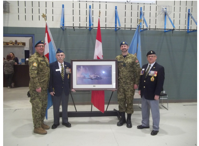
Kingsway Legion present 507 RCAC (Sir Winston Churchill) with a picture of a Spitfire.