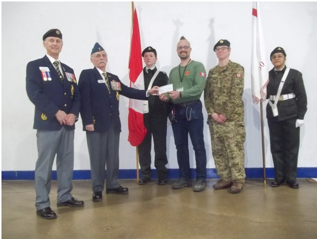
Kingsway Legion present a cheque for $400.00 180 RCACC (20th Field Artillery Regiment)