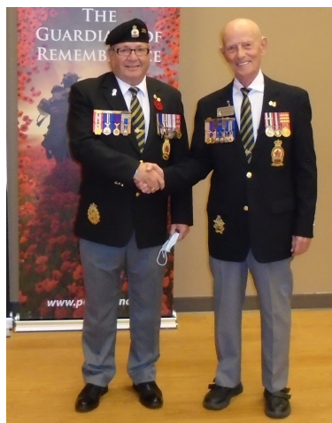
10 Year Pin