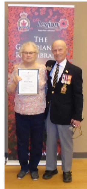
Certificate of Merit

The follow members were recognised for their time & work with the Legion: