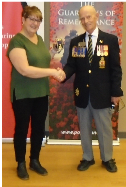
Branch Service Medal