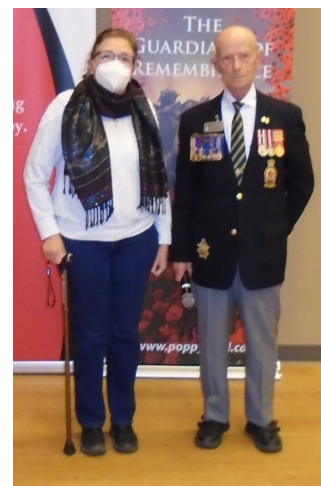
5 Year Pin