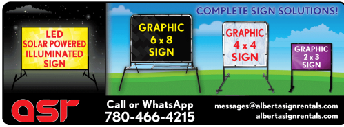
Alberta Sign Rentals