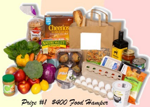
Prize #1 $400 Food Hamper (may not be as shown)