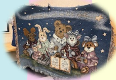
Prize #4 Limited Edition Blanket & Basket (value $80)

Tickets available at the front desk or any LA member. Tickets: $2.00 each