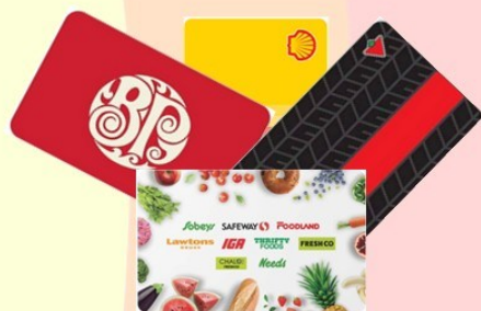
Prize #3 Assorted Gift Cards (value $250) (cards may not be as shown)