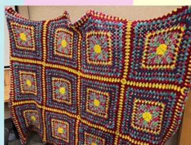
Prize #2 Queen Crocheted Blanket (value $300)