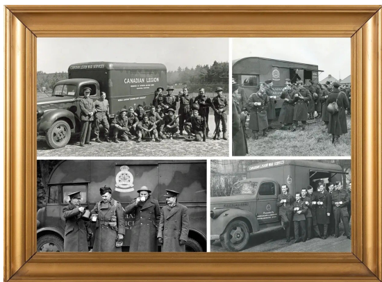
Canadian Legion War Services vehicle overseas during WWII