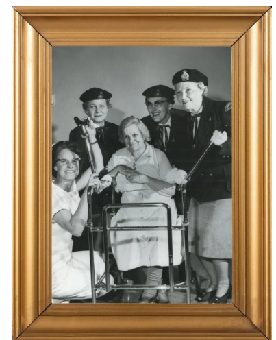
The Ladies' Auxiliary originated during WW1 when women were asked to help wounded Veterans returning home, and to provide supports for their families.