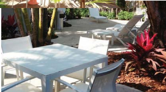
(Top to Bottom) Tranquilo Hotell, Hotel Lush Royale, Winterset Suites, Tara Hotel