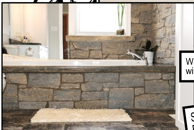
Weatheredge Limestone Ledgerrock with matching Polished Sill and Tub Surround.