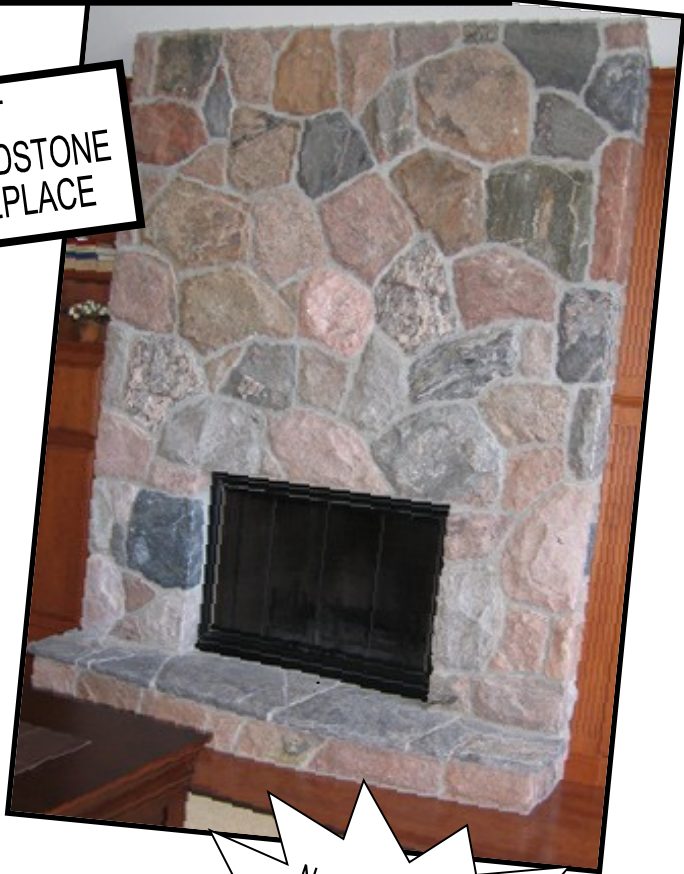
SPLIT FIELDSTONE FIREPLACE

Note: Many exterior Landscape products also available.