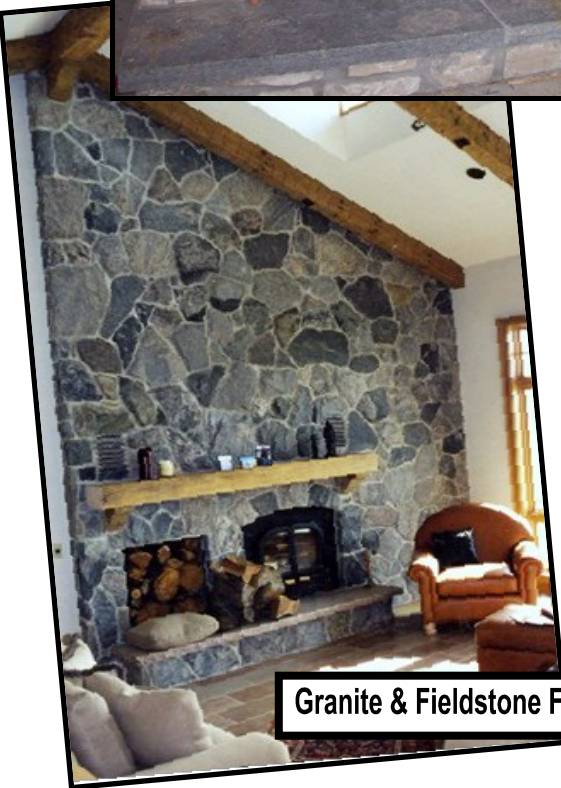
Granite & Fieldstone Fireplace ( All Greys )

Colonial Brick & Stone Inc. 5956 Perth Rd. 119 Brunner, ON N0K 1C0 Tel. 519-595-4261 fax. 519-595-4261 website. www.colonialbrickandstone.com email. colonial@perth.net