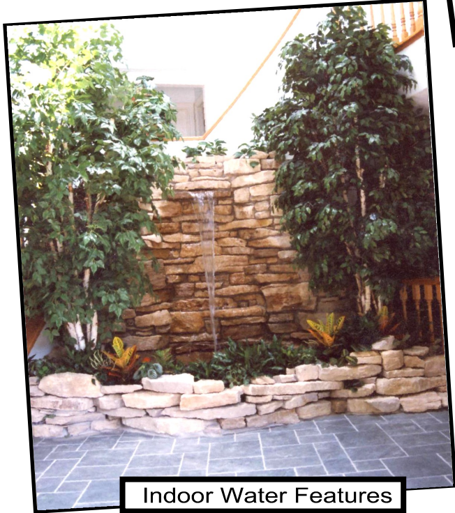
Indoor Water Features

Note: Many exterior Landscape products also available.