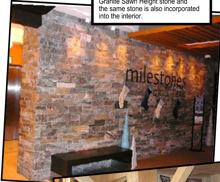
This MILESTONES is located in Niagara. The exterior of this restaurant is accented with Elite Blue Granite Sawn Height stone and the same stone is also incorporated into the interior.

Our Natural Stone is available in a THIN VENEER or full thickness Building Stone to meet your needs.