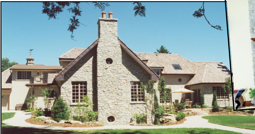
{ Outside }

WHITE TO GREY LIMESTONE ( Notice the window coming through the fireplace. )