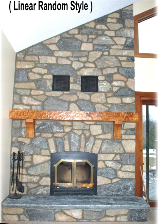
Elite Blue Granite & Harvest Gold Limestone Blend ( Linear Random Style )