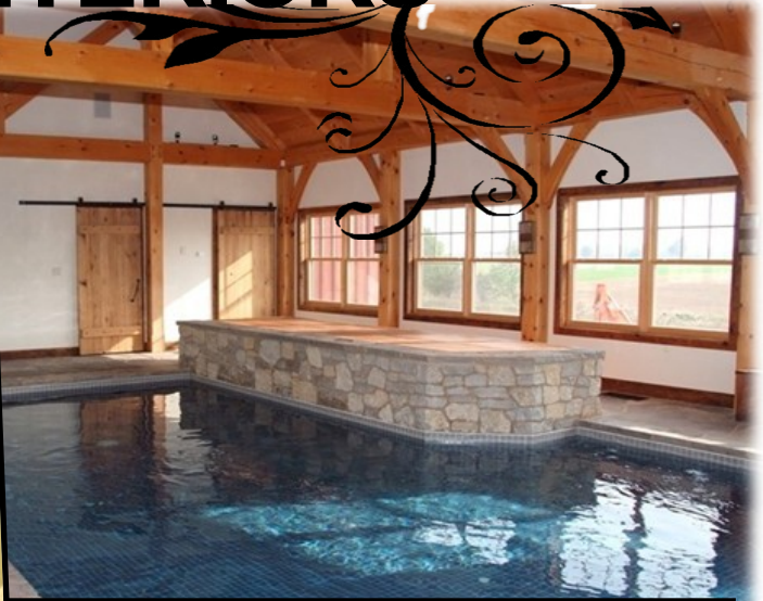
TUMBLER HARVEST GOLD OLD MILL BLEND