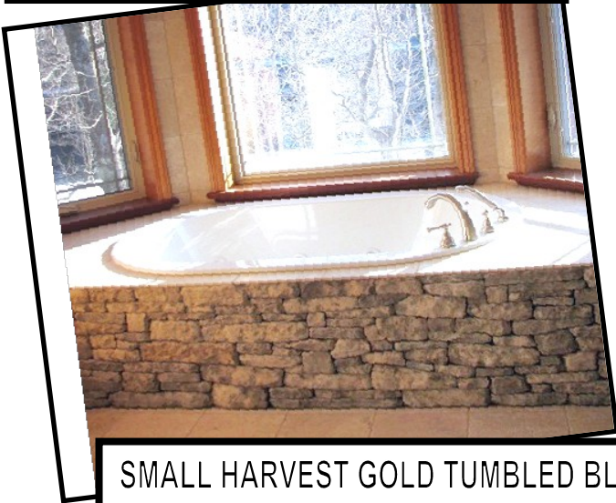
SMALL HARVEST GOLD TUMBLER BLEND