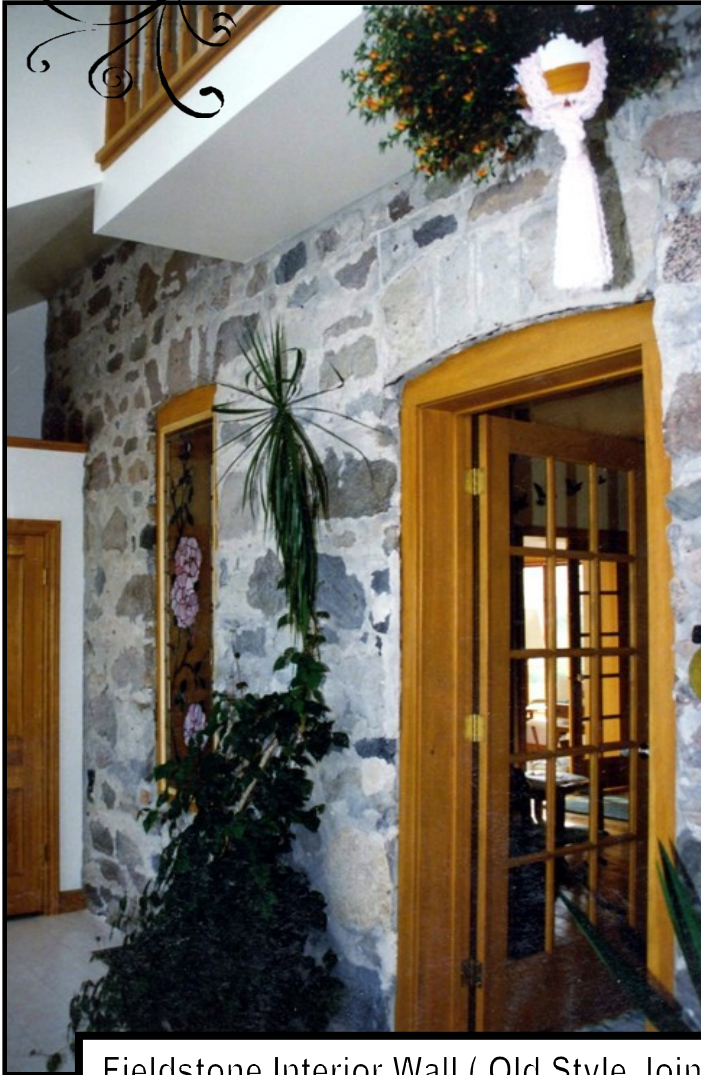
Fieldstone Interior Wall ( Old Style Joints )

Colonial Brick & Stone Inc. 5956 Perth Rd. 119 Brunner, ON N0K 1C0 Tel. 519-595-4261 fax. 519-595-4261 website. www.colonialbrickandstone.com email. colonial@perth.net