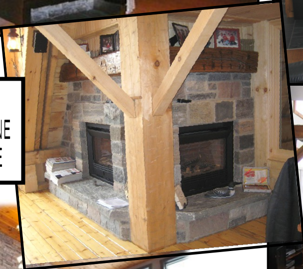
SQUARED FIELDSTONE FIREPLACE