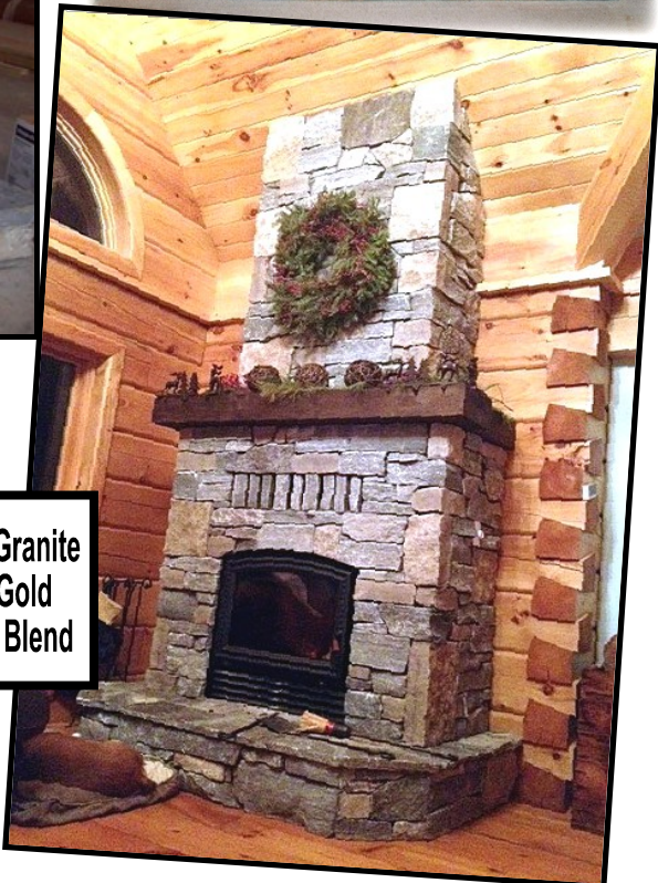
Elite Blue Granite & Harvest Gold Limestone Blend