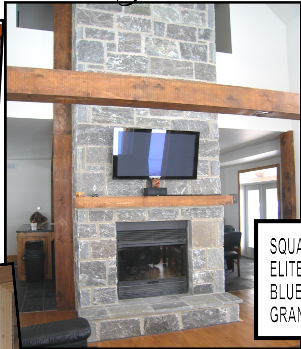
SQUARED ELITE BLUE GRANITE