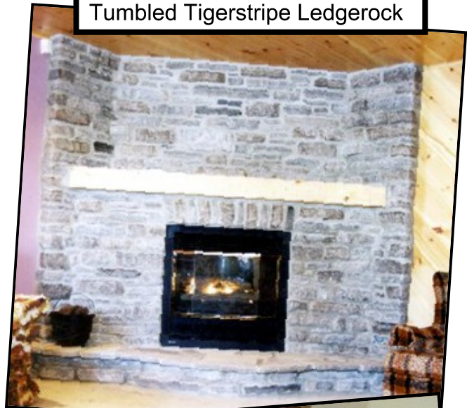
Tumbled Tigerstripe Ledgerrock