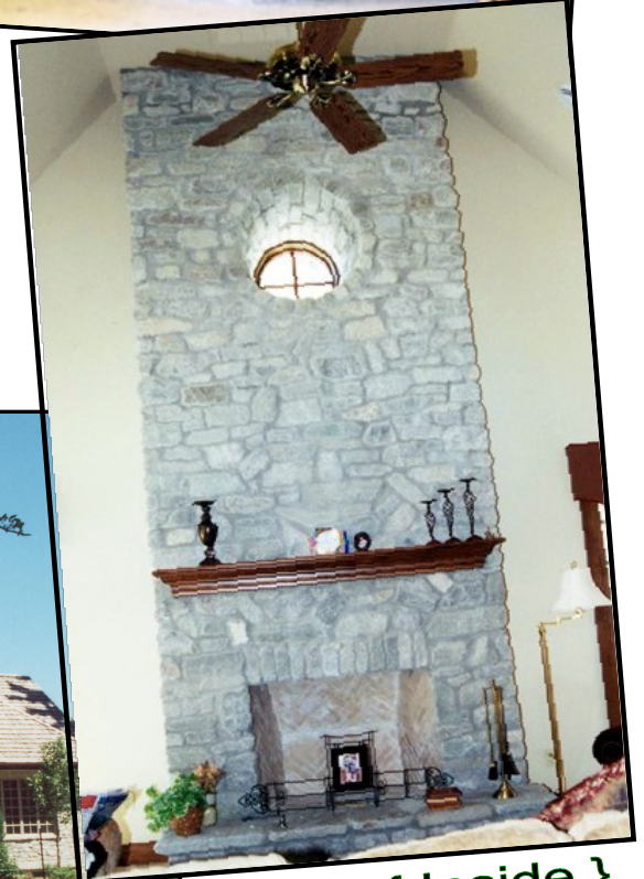
{ Inside }

WHITE TO GREY LIMESTONE ( Notice the window coming through the fireplace. )