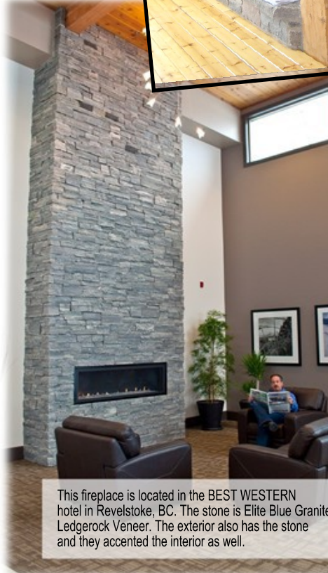
This fireplace is located in the BEST WESTERN hotel in Revelstoke, BC. The stone is Elite Blue Granite Ledgerrock Veneer. The exterior also has the stone and they accented the interior as well.